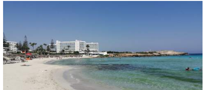
Iwona, Tourism and Recreation student of AIK, Erasmus August - October 2020, Cyprus