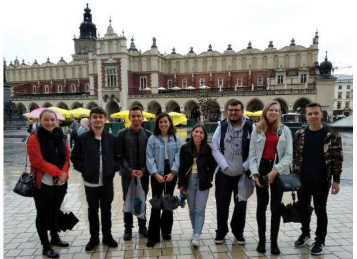
Welcome Days- City Game, 26th September 2020

Due to the current epidemic situation, the final number of students who will come to the Ignatianum may change.