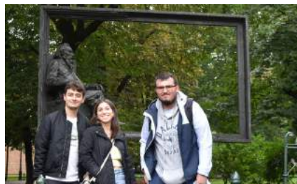
Welcome Days- City Game, 26th September 2020