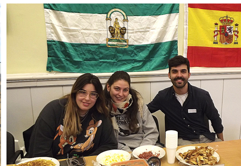
International Day, 4th December 2019