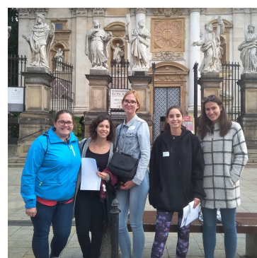
Welcome Day- City Game, 28th September 2019

During the Welcome Days , new students had the opportunity to complete the necessary formalities as well as take part in a presentation about the university, meet their mentors, explore the city, and integrate.