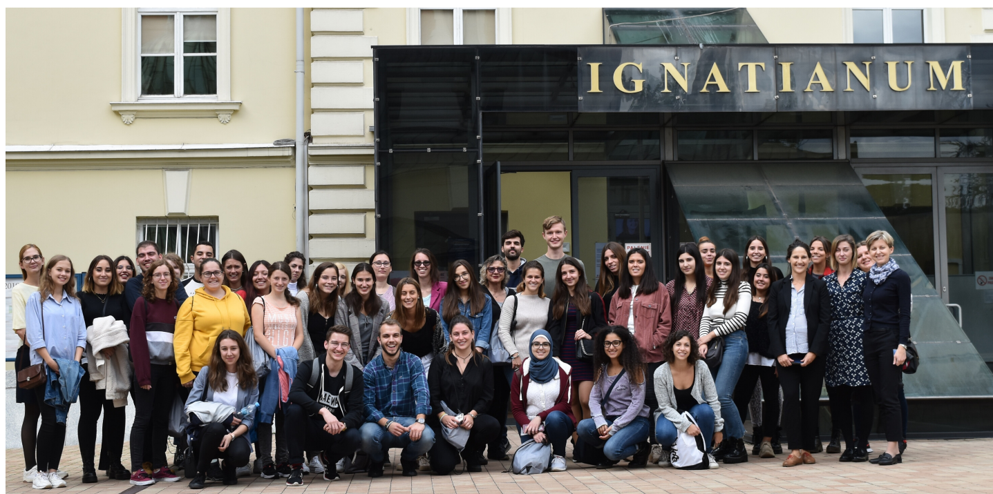
Welcome Day, 27th September 2019

INTERNATIONAL RELATIONS OFFICE OF JESUIT UNIVERSITY IGNATIANUM IN KRAKOW, POLAND