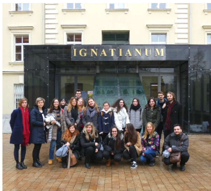
Welcome Day, 21th February 2020