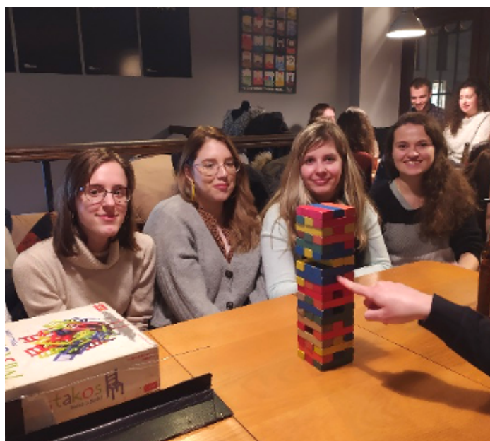
Welcome Day, 21th February 2020

Furthermore, 8 Spanish students who came to Poland in September decided to extend their mobility and stay with us for a further four months! Traditionally, new students had the opportunity to take part in the Welcome Days and have a guided tour around the city.