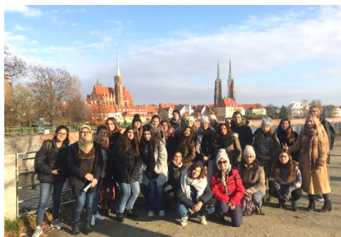
Trip to Wrocław, 23-24th November 2019